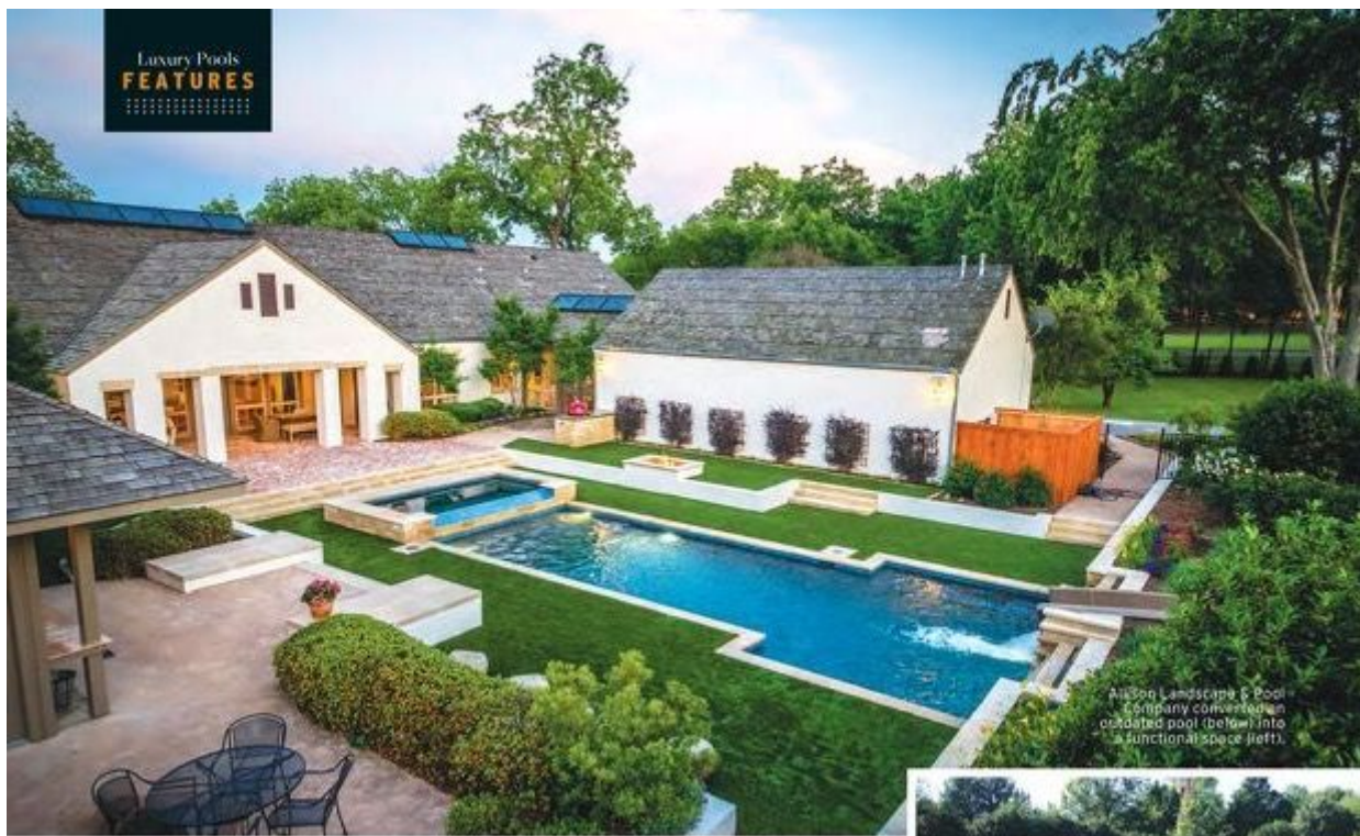
Allison Landscape & Pool Company converted an outdated pool (below) into a functional space (left).